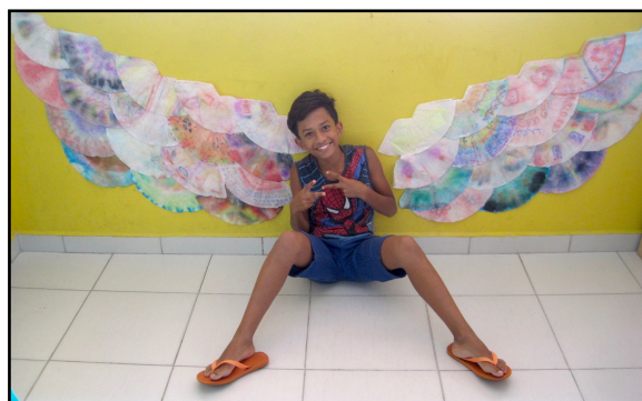
Mural made from the children's art

In addition, we held exhibition showcases of the artwork made in 'Clube de Artes' both within ACER and within St Pauls, an exclusive independent school and supporter of ACER, based in the city. By doing so, the children proudly saw their favourite pieces enjoyed by others and I hoped to raise awareness of both the impact and benefits of art making. Exhibiting the work in St Pauls was also to encourage a dialogue between the two groups and to celebrate the skills and creativity of our young people. By increasing communication, I hoped to challenge social bias.