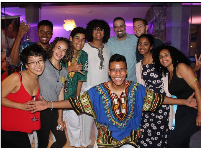
Teens and volunteers at an ACER fundraiser

This sense of confidence in my capability to overcome any challenge and learn an entire new skill is going to complement my future greatly; both within my studies and work in mental health and also in my own personal character. The perspective of having achieved so much this past year has given me hope that anything is possible, as well as ready to take on new challenges.