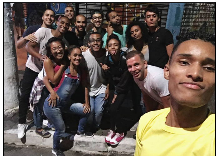
My leaving gathering with colleagues and friends