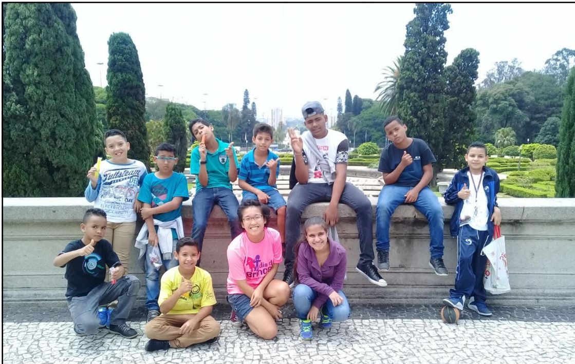
End of year trip to the Museum of Zoology