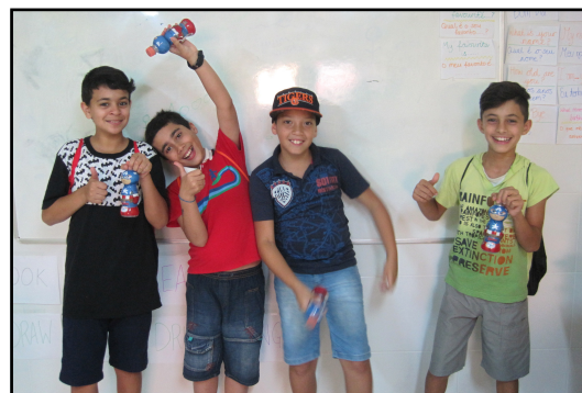
Regular 'Inglês e Artes' students

As a result of these challenges, I found myself looking closely at the intended learning outcomes within my sessions and hoped to incorporate ways to work on these issues. I continued to lead engaging sessions to encourage creativity and equality within an educative environment. Over the year, Articulate was relocated to a new classroom, a space solely for our projects which allowed us to freely decorate and structure the space.