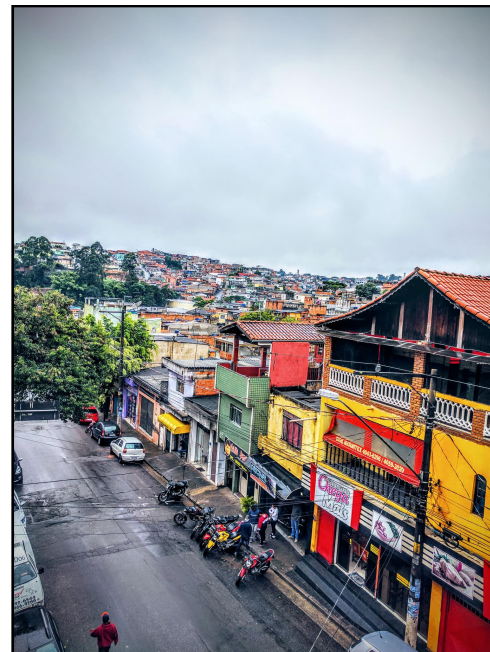
Street view looking out from ACER

In my previous six-month report, I touched upon some of the difficulties in the community of Eldorado in Diadema. Issues such as over-population, substance abuse and violent behaviours greatly impact the children on a daily basis. After a further six months, it became apparent that the struggles run deeper still. My proficiency in Portuguese and living in the community of Eldorado allowed me to see the vast class and race divide within the city of São Paulo; many areas within the city feel truly worlds apart. 50.7% of the population of Brazil define themselves as black or mixed race, yet statistics show that on average, White Brazilians earn double to that of Black Brazilians and within the centre of the city, less than 20% identify as black or mixed race. In Brazil's history, inequality and racism was a result of Portuguese colonisers enslaving an estimated 4.9 million Indigenous and Africans Brazilians, and the systemic racial inequality in society is still heavily apparent.